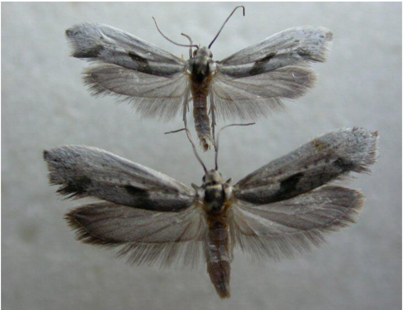
Prays peregrina - male (top photo) and female (bottom photo)

Prays peregrina was first described by Agassiz (2007) after captures in the London area between 2003 and 2007. Its foodplant and life history were unknown, but he thought it was an adventive species, possibly Asiatic.