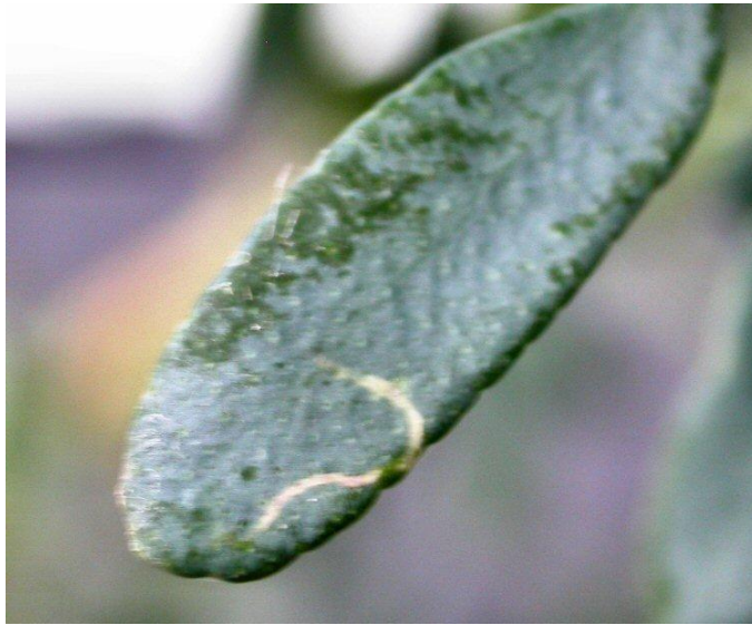
First instar mine (above) and later instar mines (below)