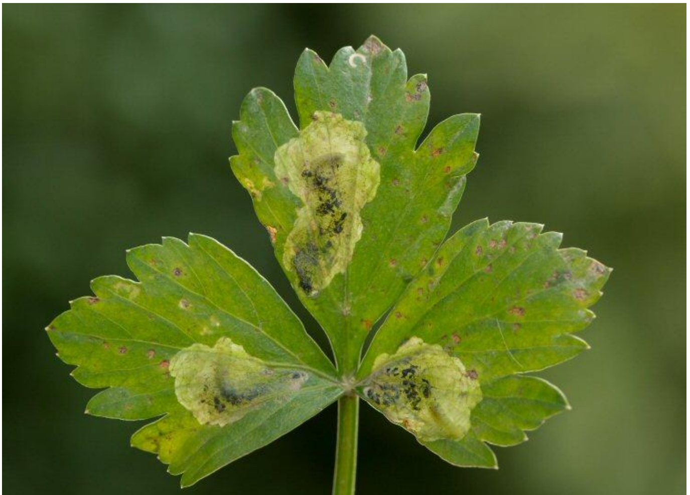
Phytomyza angelicae Kaltenbach, 1872